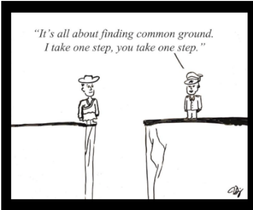
CARTOON DRAWN BY FORMER EXECUTIVE DIRECTOR OF SFT, TENDOR. SUBMITTED BY STUDENTS FOR FREE TIBET EARLHAM